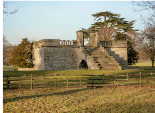
Queen Mary's Bower

kissing gate, continuing on to Baslow carpark.