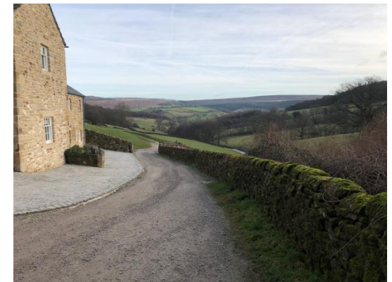
View from Ryecroft & Pingle cottages

Follow the pedestrian walkway towards Carlton Lees car park, keeping to the edge of the lane through to Carlton Lees village. Ignore the turning to the garden centre (toilets and a café available) and continue straight on. At the junction at the end of the village take the track ahead signposted to Ryecroft and Pingle cottages.