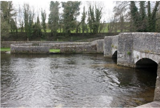
The Sheep Wash At Sheepwash Bridge

Leave the cutting by passing under the bridge and walk along the trail to a point where a second bridge comes into view and the footpath from Little Longstone to Ashford-In-The-Water crosses the Monsal Trail. Take the path on the right to Ashford and step down the steep stone ladder stile into the adjacent field, cross the field to a stone step stile into a second field then keeping the field boundary to the left walk forward to a squeeze stile on the far side of the field. Cross the next field maintaining the same direction to a gates step stile with a muddy approach, wooden pallets have been provided by the landowner to allow passage across the area of mud. Cross the remaining fields on the same heading and exit through a stone squeeze stile in a wire fence to exit onto Longstone Lane.