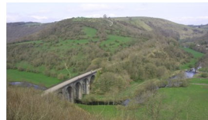
View from Monsal Head

If Hob's Café is open leave the path at this point to pay it a visit, otherwise continue along the path and go down the steep stepped path into the dale, after a short distance at a bench the path divides. At the junction of paths take the path to the left that doubles back and leads down to the site of the former Monsal station between the Headstone Viaduct and the Hedstone Tunnel. On reaching the Monsal Trail between the